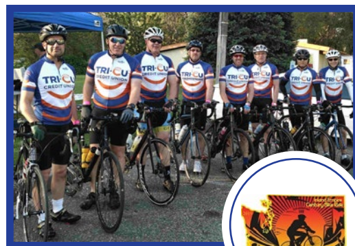
Kiwanis Inland Empire Century Event