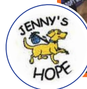
Jenny's Hope Pet Adoption